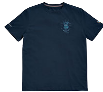
R 51 T-shirt, unisex