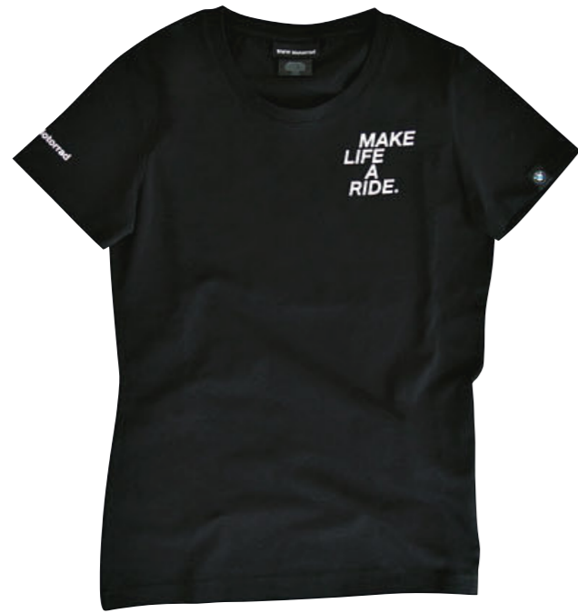
Make Life a Ride T-shirt, men*