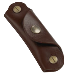
BMW Motorrad bracelet