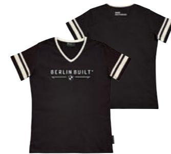
Berlin Built T-shirt, men