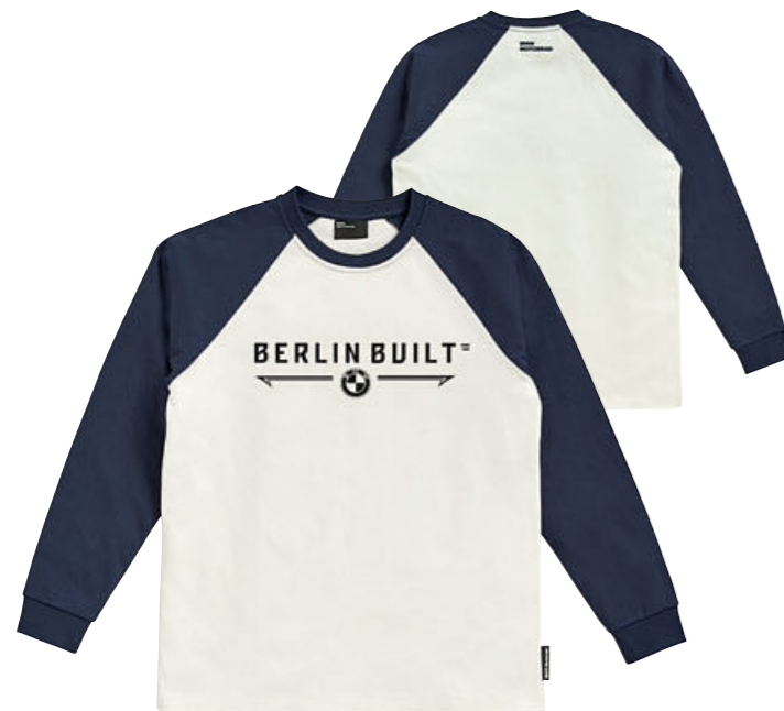
Berlin Built T-shirt, women