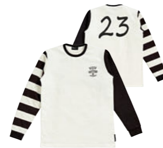
Dealer shirt, men