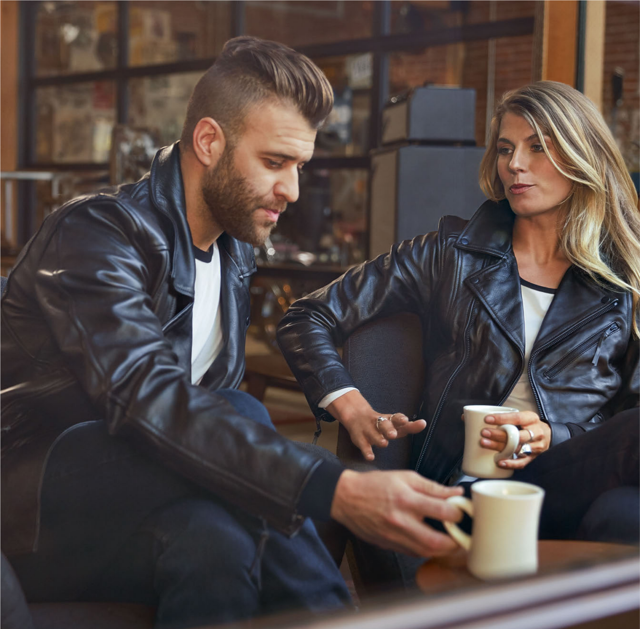
FlatTwin leather jacket, women