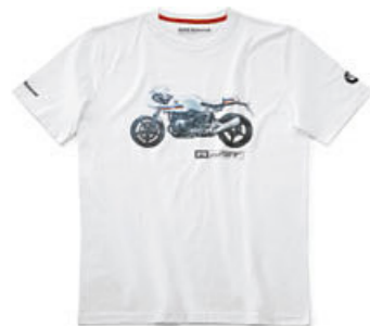
R nineT T-shirt, unisex