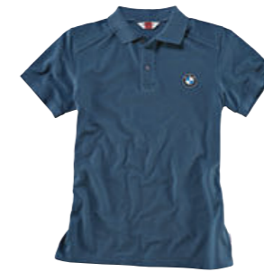
BMW Motorrad polo shirt, men