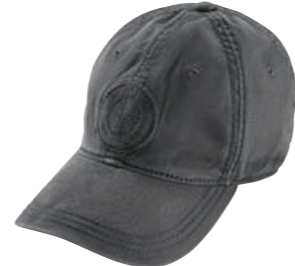
Smart CC cap