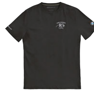
R 90 DAYTONA T-shirt, unisex