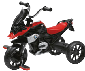
BMW R 1200 GS RideOn