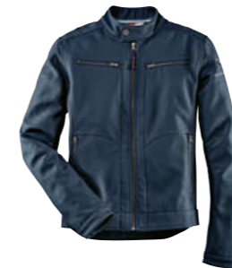
BMW Logo windbreaker, unisex