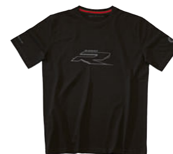
S 1000 RR T-shirt, unisex NEW