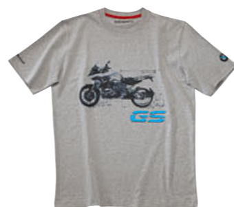
R 1250 GS Adventure T-shirt, unisex NEW