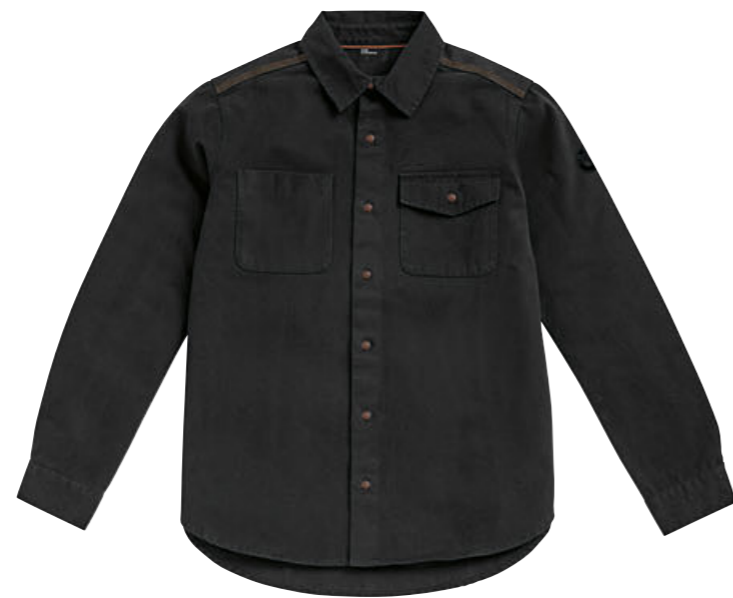
Denim shirt, men