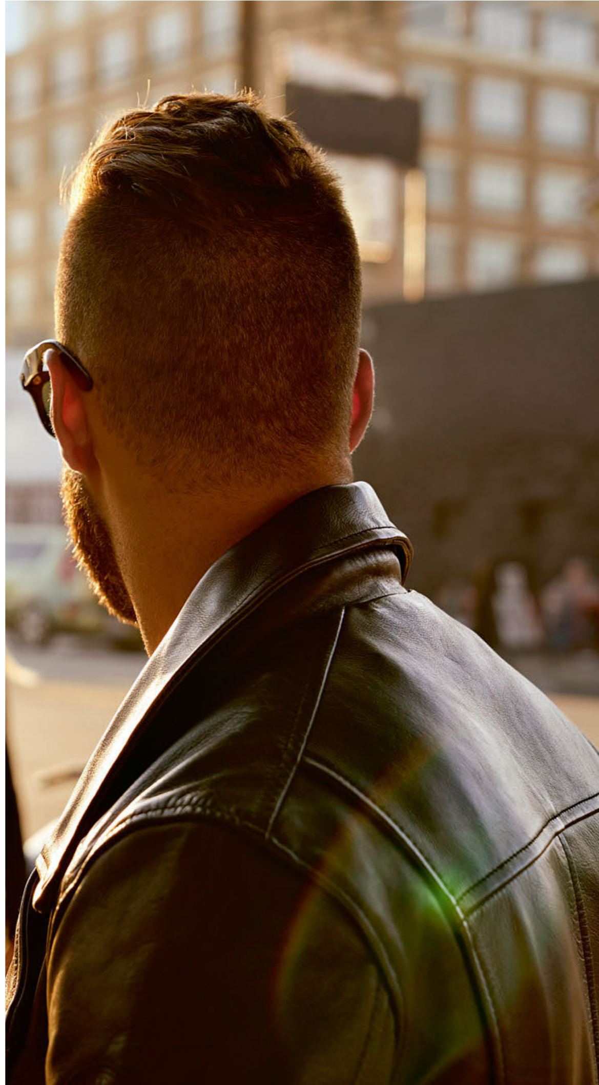
Club college jacket, women