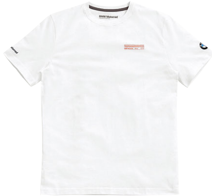
R 1250 RS T-shirt, unisex NEW