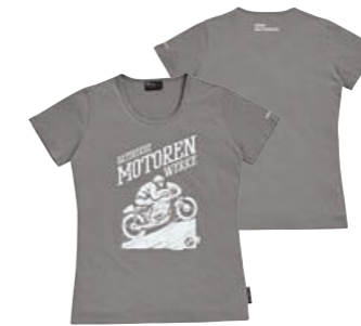
Mechanikerin tank top, women