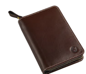
BMW Motorrad mobile phone case