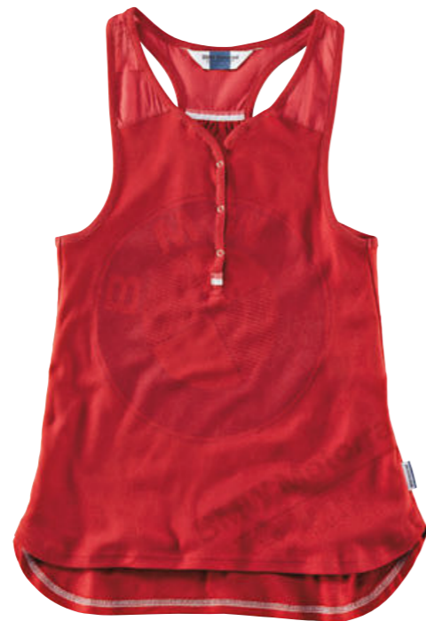
BMW Logo T-shirt, men