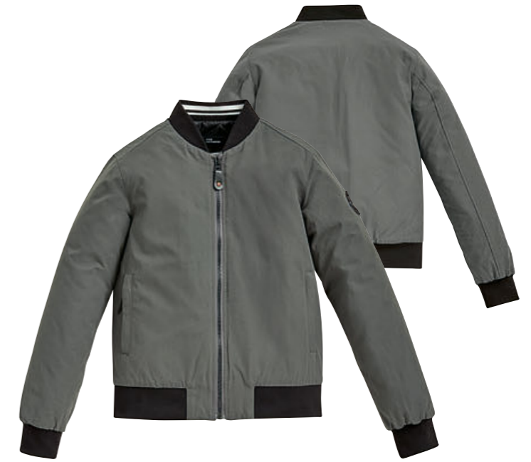
Club college jacket, men