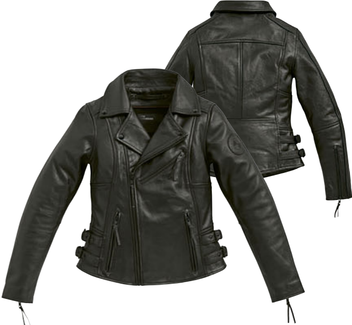
FlatTwin leather jacket, men