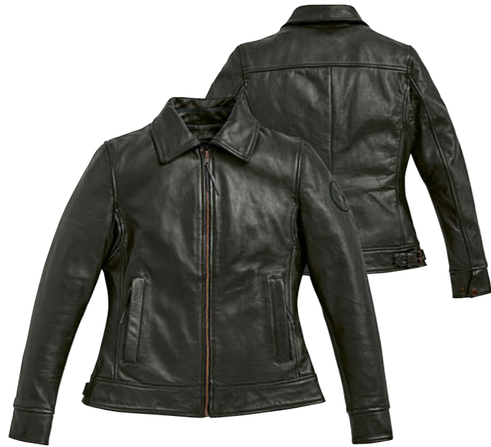
Engineer leather jacket, men