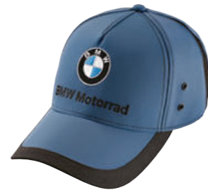
BMW Motorrad cap