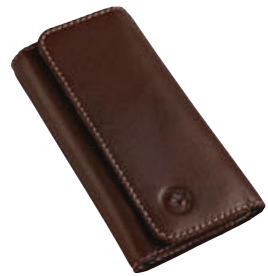
BMW Motorrad keyring