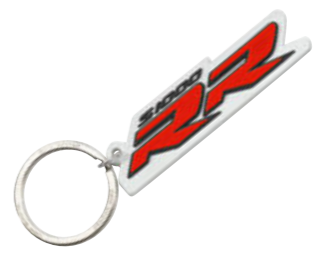
S 1000 RR keyring NEW