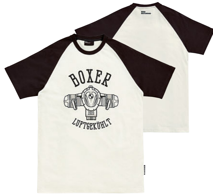
Boxer shirt, women