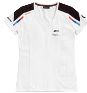
Motorsport T-shirt, men