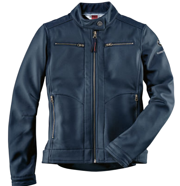
BMW Logo softshell jacket, men