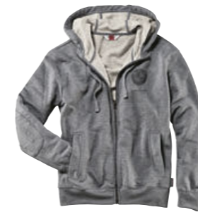
BMW Logo softshell jacket, women