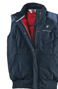
BMW Logo bodywarmer, men