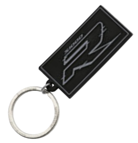
S 1000 RR keyring