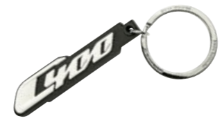
G 310 GS keyring