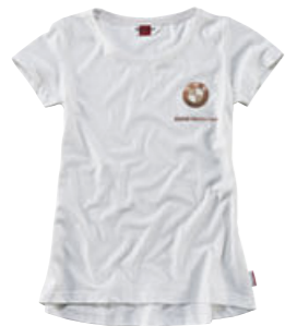
BMW Logo vest top, women