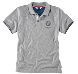
BMW Logo sweatshirt jacket, unisex