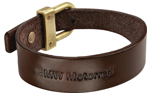
BMW Motorrad penknife