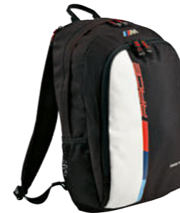
Motorsport helmet bag