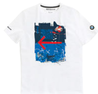
G 310 GS T-shirt, unisex