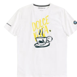
S 1000 R T-shirt, unisex