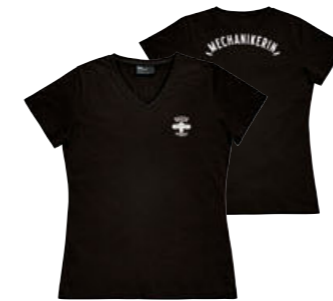
Bergkönigin T-shirt, women