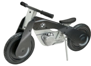
BMW R 1200 GS Pedal