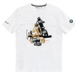
R 1200 GS T-shirt, unisex