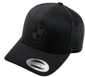
BMW Motorrad GS cap