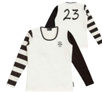
Boxer shirt, men