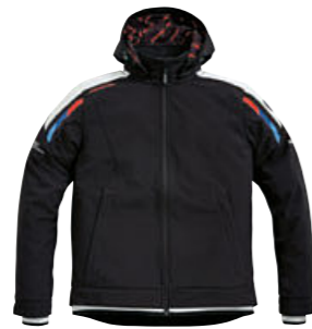
2-in-1 Motorsport jacket, unisex