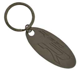
R 1250 RS keyring NEW