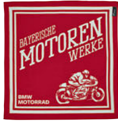
Berlin Built bandana