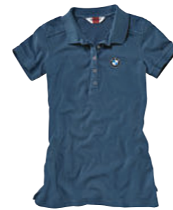
BMW Logo polo shirt, men