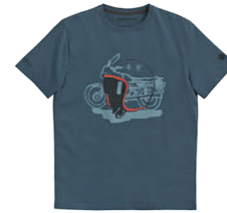
R nineT Urban G/S T-shirt, unisex