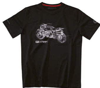
BAGGER T-shirt, unisex