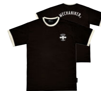
Bergkönig T-shirt, men