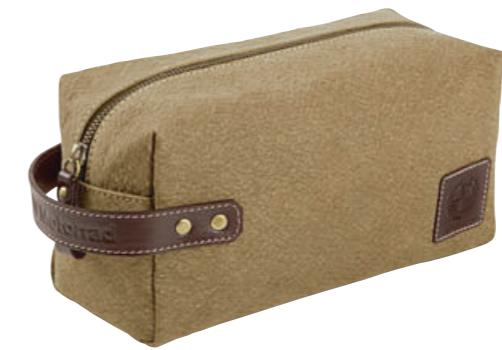
BMW Motorrad notepad