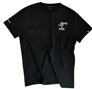
BMW Motorrad T-shirt, men