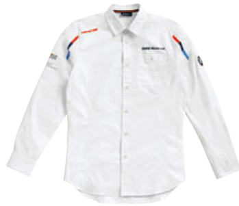
Motorsport T-shirt, women