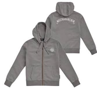
Mechaniker zip hoodie, men