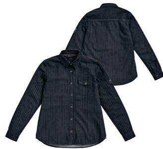
Worker long-sleeved shirt, men