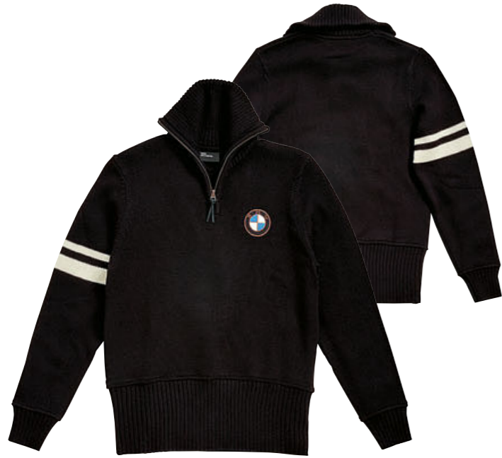
Mechanikerin zip hoodie, women