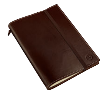
BMW Motorrad wallet