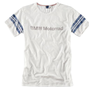
BMW Logo T-shirt, women