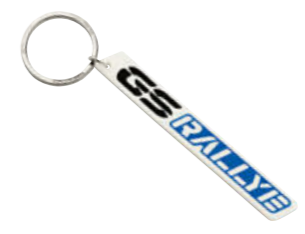
R nineT keyring