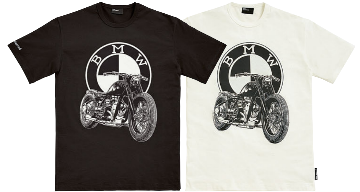
Berlin Built shirt, men