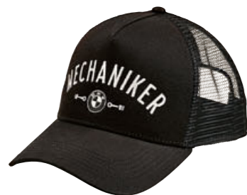
Luftgekühlt knitted beanie