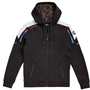
Motorsport softshell jacket, unisex