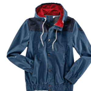
BMW Logo bodywarmer, women