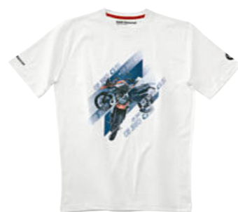
F 850 GS T-shirt, unisex