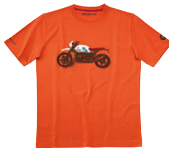
R nineT Scrambler T-shirt, unisex