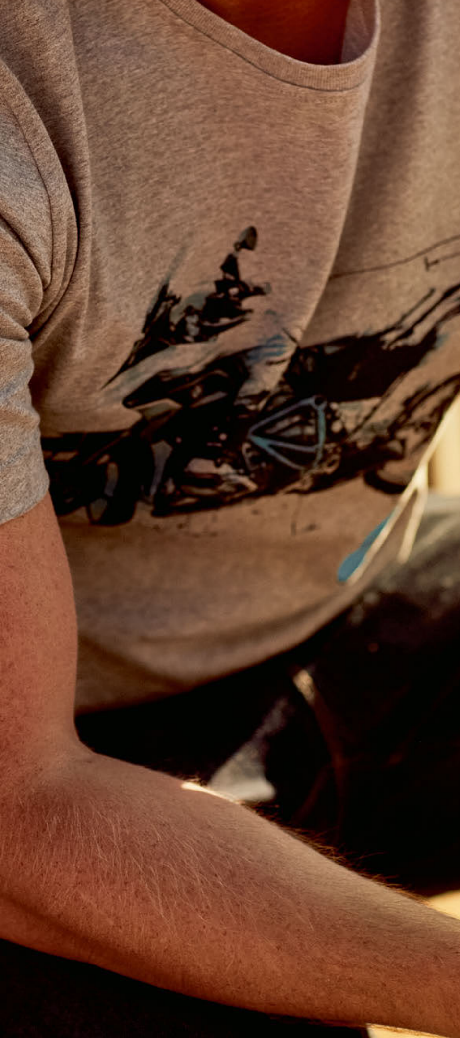
GS DAKAR T-shirt, unisex