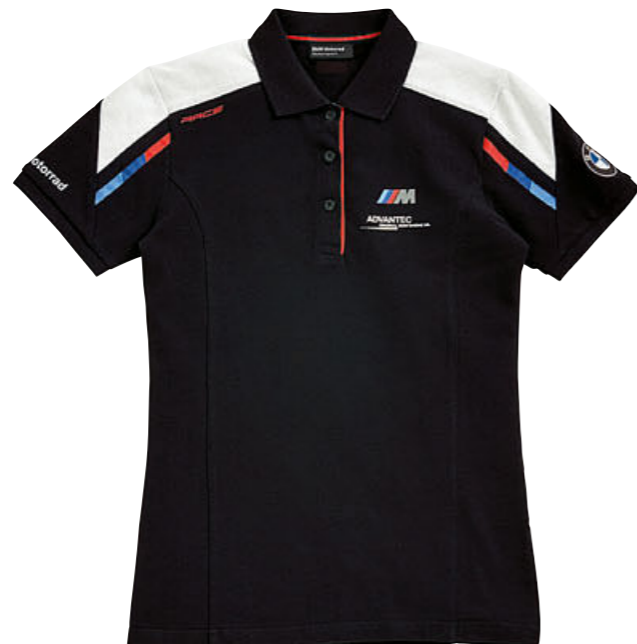
Motorsport polo shirt, men