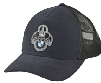
BMW Motorrad knitted beanie